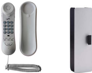
Figure 2: Standard Phone and Phone Box

If the unit has a standard phone, it is located in the cab phone box (see below).