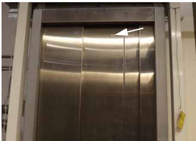
Figure 4: Auto Slim Landing Doors Emergency Opening

When power is turned back on, the elevator will go to the lower landing to relearn the doors.