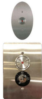
Figure 3: Hall Call

The Landing Door/Gate lock prevents the movement of the cab unless the door/gate is in the closed and locked position. If the door/gate is not completely closed, the cab will not move.